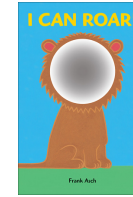
I Can Roar by Frank Asch