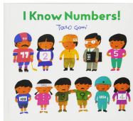
I Know Numbers! by Taro Gomi